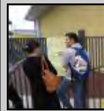
"Lets talk Fridays" at Eastside Learning Center

Send your student success stories to: dominic.shambra@lausd.net