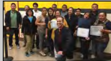
Students from Roosevelt CAS ESL program participate in Promotional Ceremony.. Congratulations!