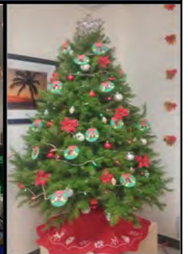
THANK YOU HOME DEPOT!