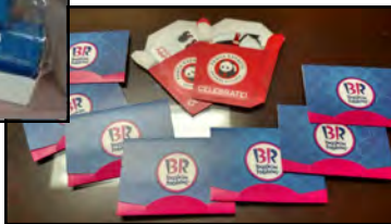
Some of the donated prizes, Thank you's to those who donated and received donations!